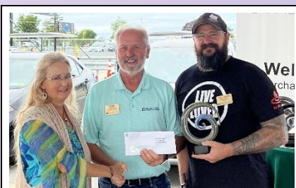
Uniquely MerMade Best in Artistic Craft