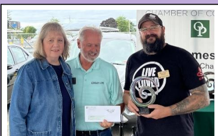
K's Glassy Kreations Best in Artistic Craft