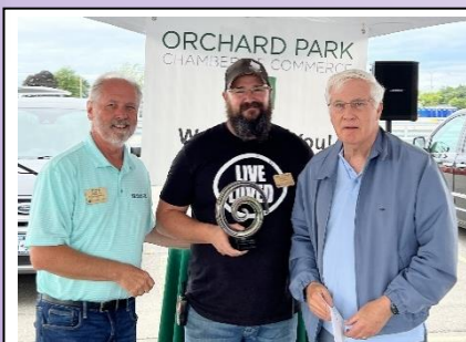
Asaph Waters Editions Best in Graphic Arts & Drawing