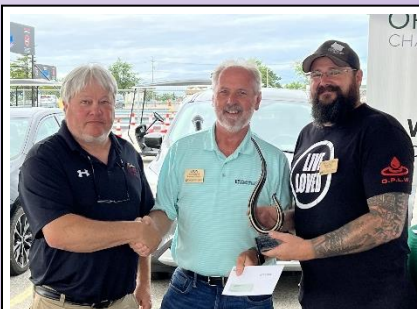
Custom Country Woods Best of Show