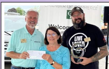
Piecemaker Fiber Art Best in Artistic Craft