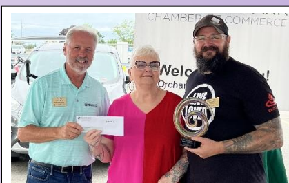
Nanny Goat Bazaar Best in Sculpture