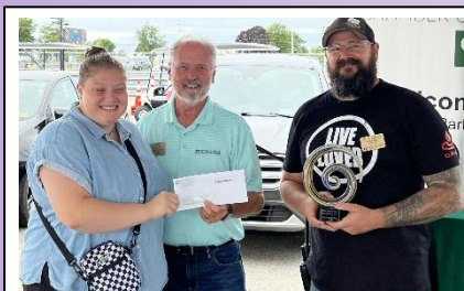
Meaghan Lopez Photography Best in Photography