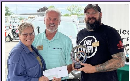
Sue Hurley Fine Arts Best in Painting