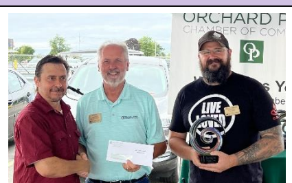
Turning Treasures Best in Artistic Craft