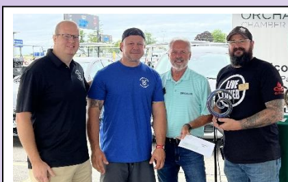
WNY Wood Products Best Booth Display