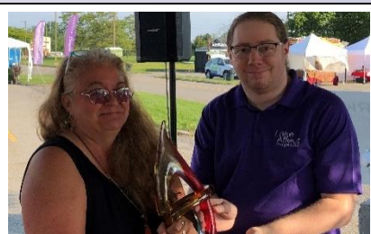
Rusty Button Studio Best in Artistic Craft