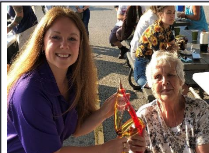
Martin Calligraphics Best in Graphic Arts & Drawing