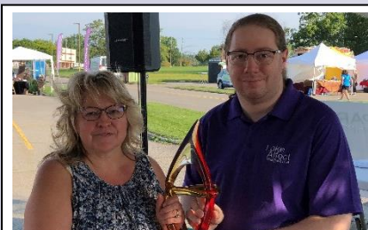
Rustic Originals Best Booth Display