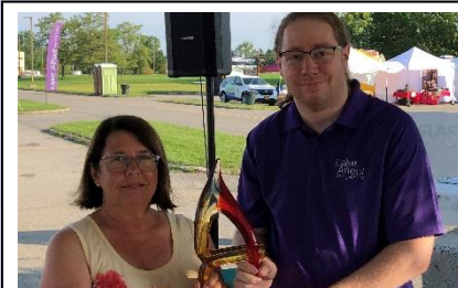
Piecemaker Fiber Art Best in Artistic Craft