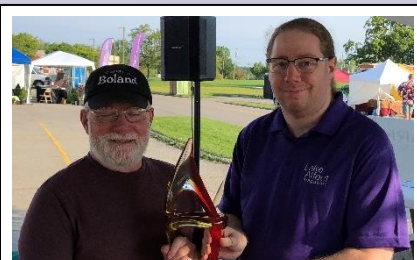
Creations by Boland Best in Artistic Craft