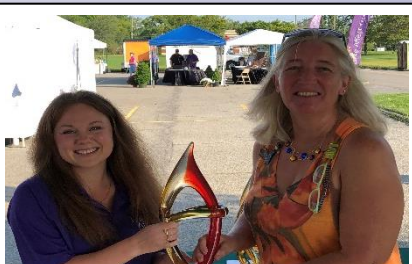
By Design Best in Jewelry