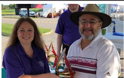
Bella Nome Wire Designs Best in Sculpture