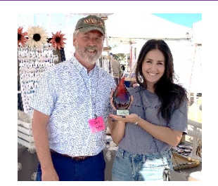
Buffalo Bead Bar Best Booth Display