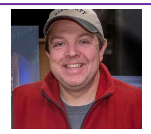
Tom Burns Photography Best in Photography