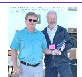
Pins & Pens Best in Artistic Craft